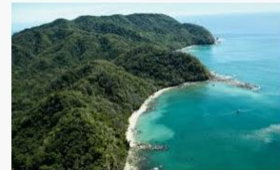
Blue Zone: Some of the Healthiest ... number8.com