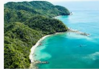
Costa Rica's Nicoya Peninsula ... travelawaits.com