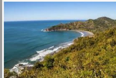
icoya Peninsula - Costa Rica: Get the ... mesofindia.indiatimes.com