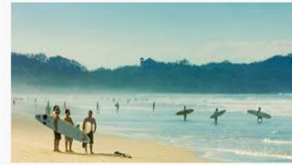
Nicoya Peninsula, Costa Rica: On the...